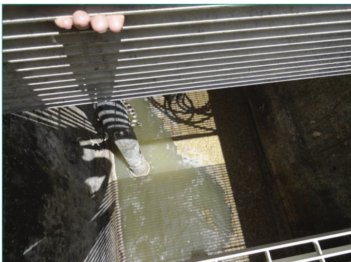
Fig. 4: May 18, 2012 after three months of treatment, the grease cap has not returned.