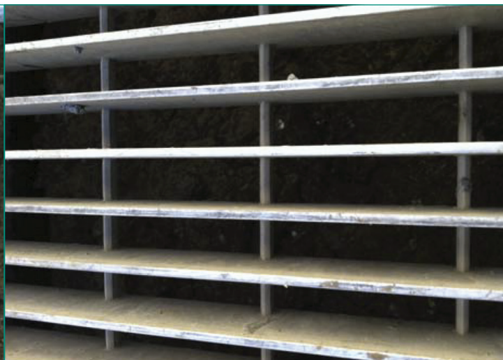
Fig. 2 & 3: These pictures show a side view with gate open and a top view with gate closed.