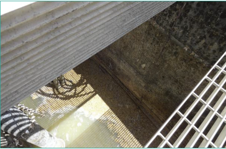
Fig. 5 & 6 These pictures further demonstrate the lack of new buildup of the grease cap when seen from a side view and through the grate from the top.