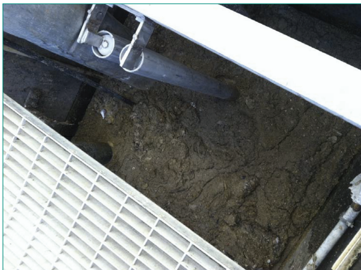
Fig. 1: With the grate open, a 2 - 3 foot grease layer is evident prior to treatment.